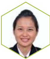
ALLENA Indigo Airlines